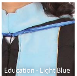
Education - Light Blue