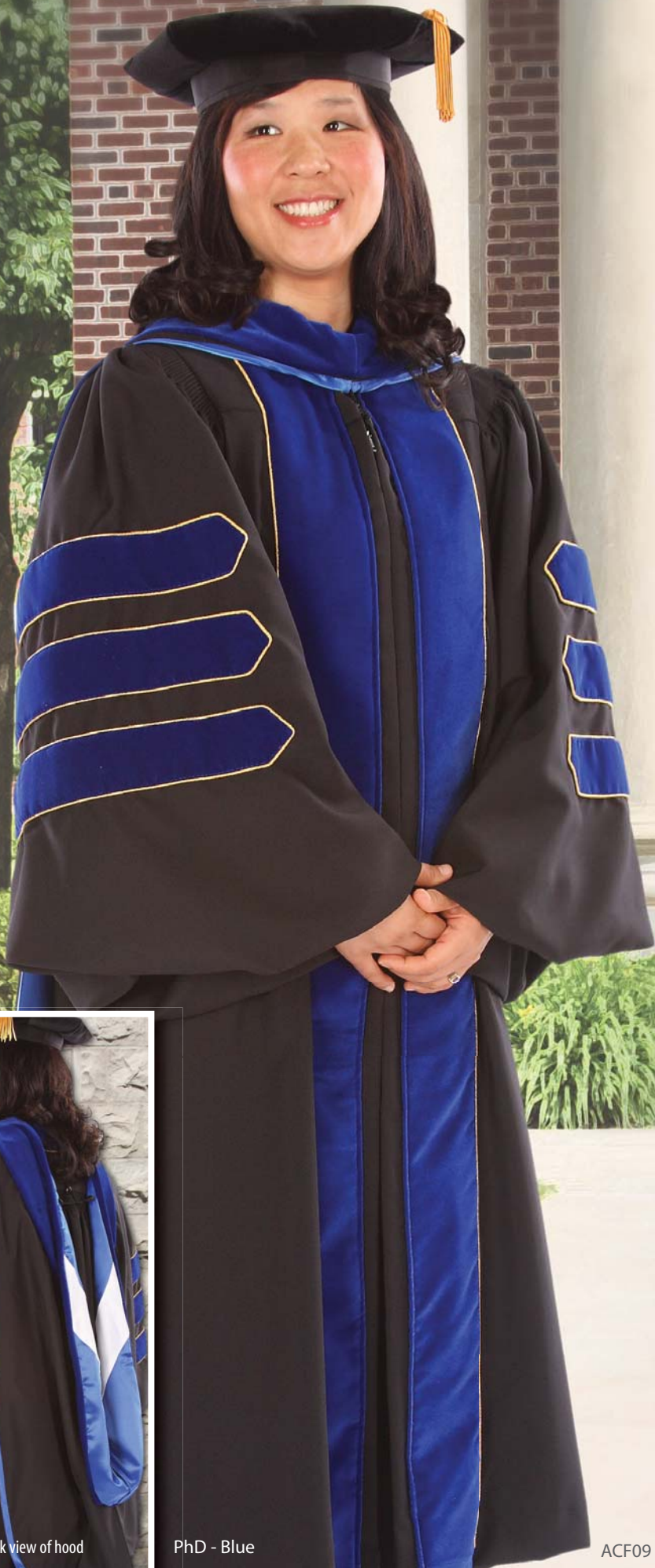
PhD - Blue