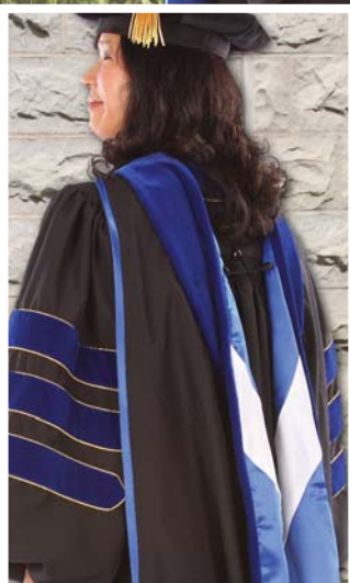
Back view of hood