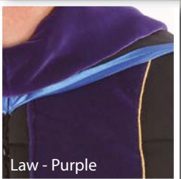
Law - Purple